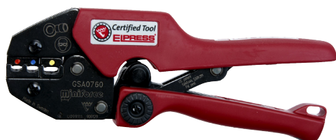
Certified Crimping tool GSA0760, crimp area 0.5-6 mm 2